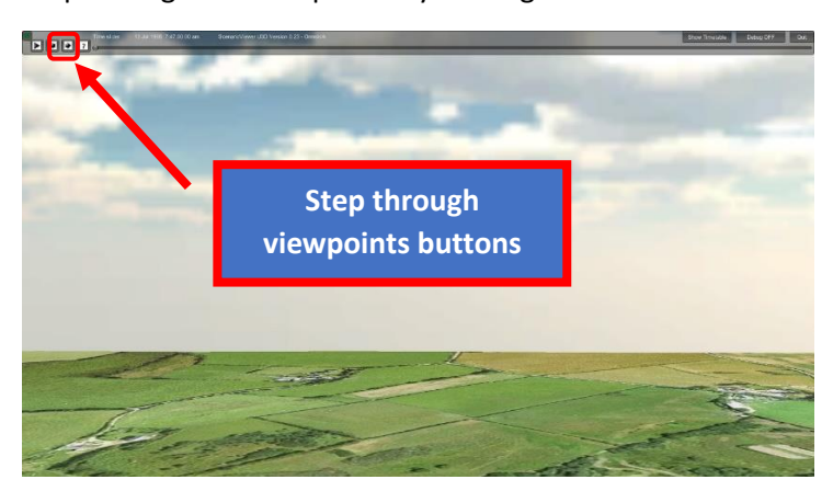
Figure 2: On clicking on Run

Step through the viewpoints by clicking on these two buttons