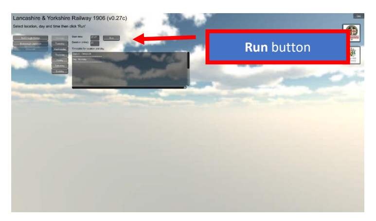
Figure 1: Startup screen

Click on Run to launch the visualisation of the chosen location, day, time and duration.